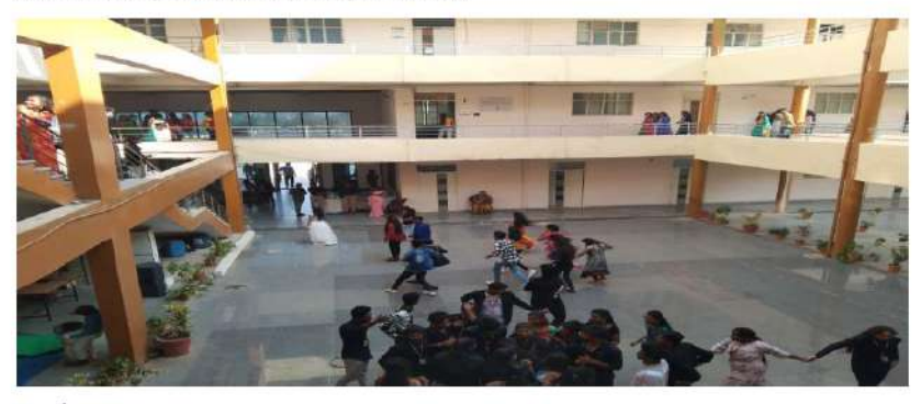
23rd Dec 2022

Overall, the Technophilia event was a grand success, and it demonstrated the talent and potential of the students in the field of technology. Such events not only benefit students but also contribute to the development of the country's technical capabilities